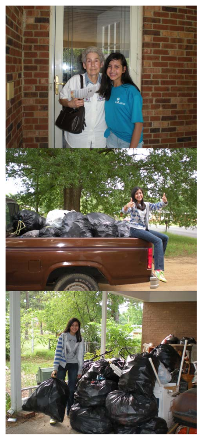
"Grandma's carport becomes a recycling center"