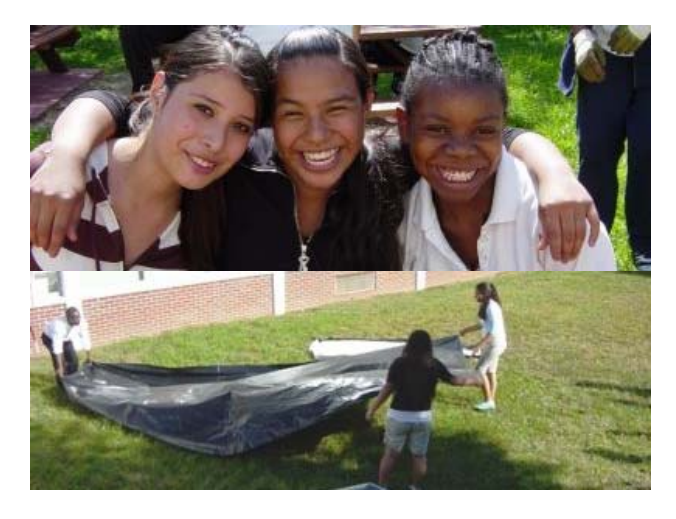
Going, Going, GREEN!

The Winston Beholdance Chapter got together and decided they had a green space that wasn't being highly utilized so they approached their administrators with the request to create a Unity Garden.